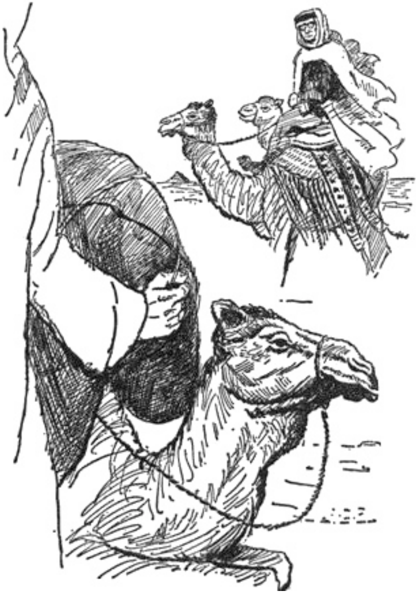
Hands pulled Rick from the saddle.

someone at work on his bonds while the hands held him upright. Suddenly the burnoose was whipped off, and the brilliant sunlight made his eyes water. He squinted against the glare.